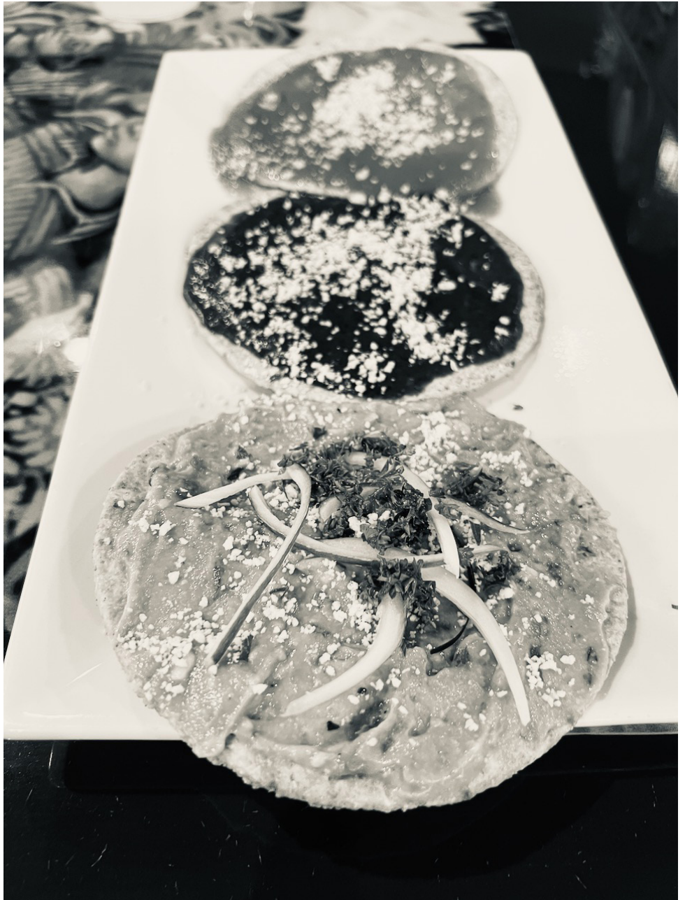
A sampler of tostadas from El Rinconcito Chapin

El Rinconcito Chapin, 3022 West Anderson Lane, elrinconcitochapin.com ☿