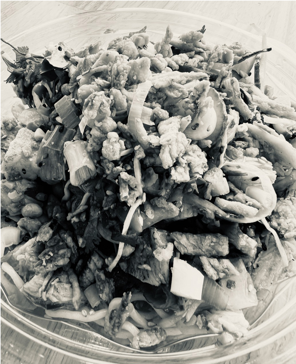
Poké from Pokeworks

Pokeworks Creekside, 3022 West Anderson Lane, pokeworks.com ☞