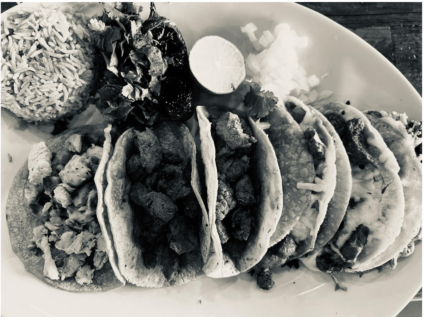
An early taco test at Que Divino Cocina Mexicana

For hotlinks (digital, not sausages from Elgin) and full-color (and expanded) reviews, please visit austinwanderlist.com . Send tips, tricks, and politely-thrown tomatoes to bubba67@mac.com . ☼